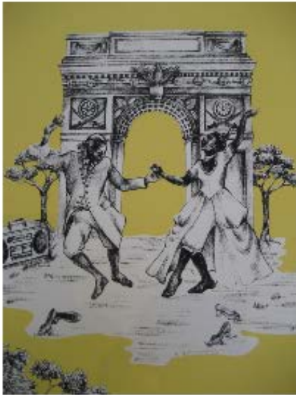
To discoveries from their travels like these hammam towels in a tangy assortment of colors.