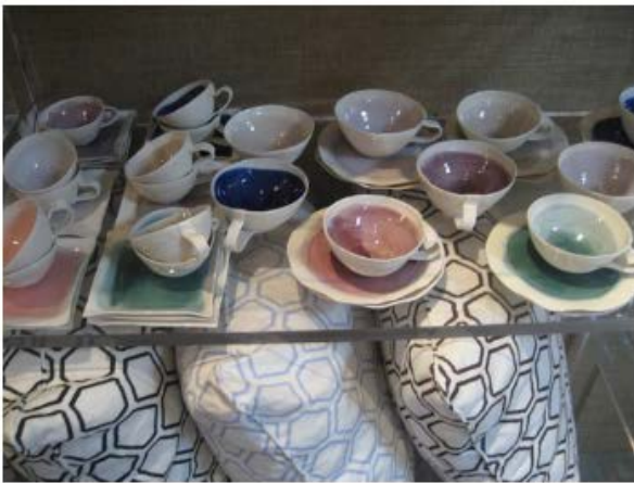
And graphic, black and white: