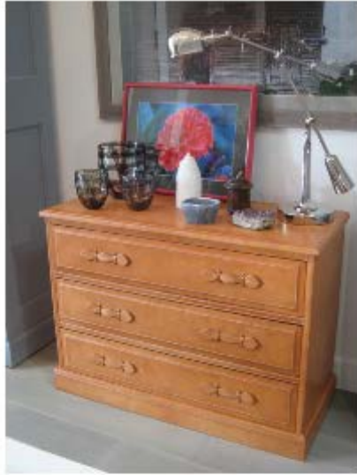
They carry an enormous range of lines from Saxor Paris 's classic prints: