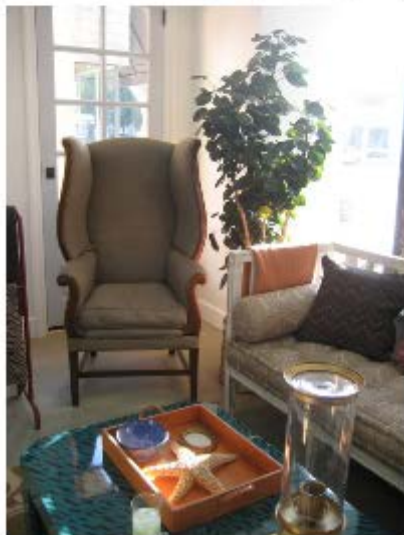
↳ Kala Landa's Egyptian inspired theme: