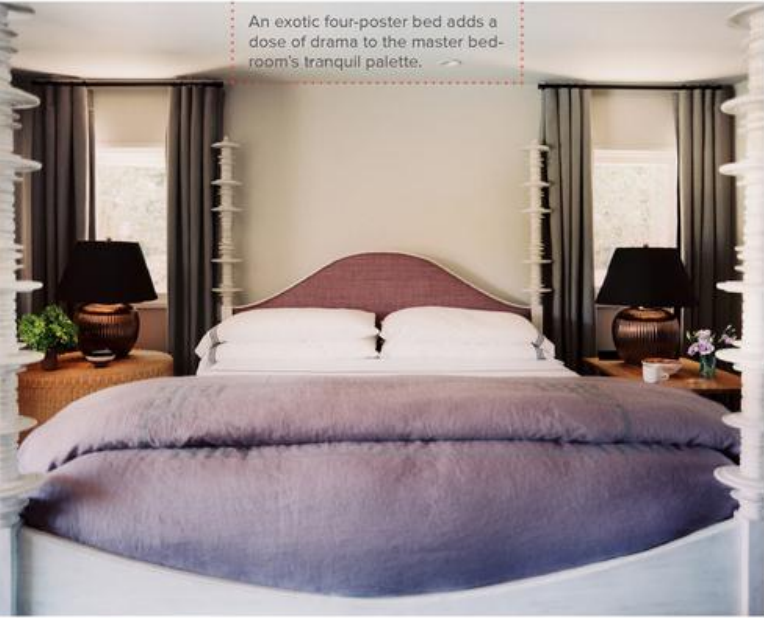
An exotic four-poster bed adds a dose of drama to the master bedroom's tranquil palette.

Play with texture, Lucas suggests, whether it's with an artisanal pottery lamp, a grass-cloth wall covering, or a Moroccan rug. It makes everything more interesting.