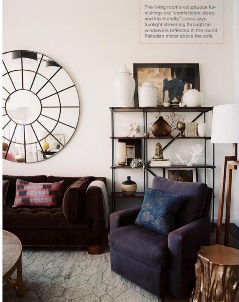
The living room's voluptuous furnishings are "comfortable, deep, and kid-friendly," Lucas says. Sunlight streaming through tall windows is reflected in the round Palladian mirror above the sofa.