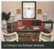
La Cienega's new Harbinger showroom